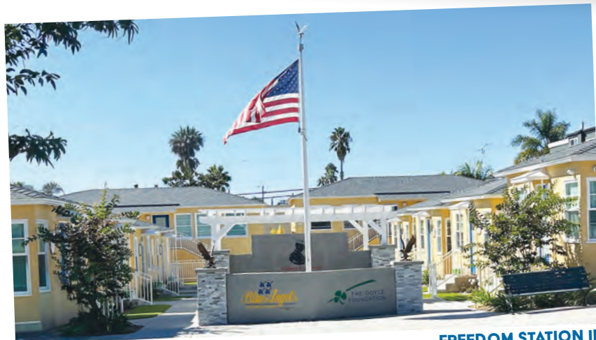
FREEDOM STATION III