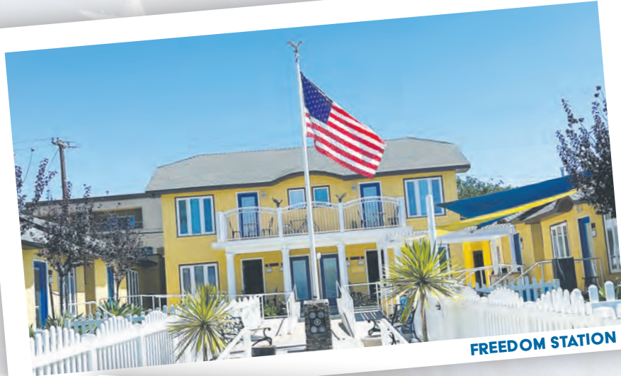
FREEDOM STATION I