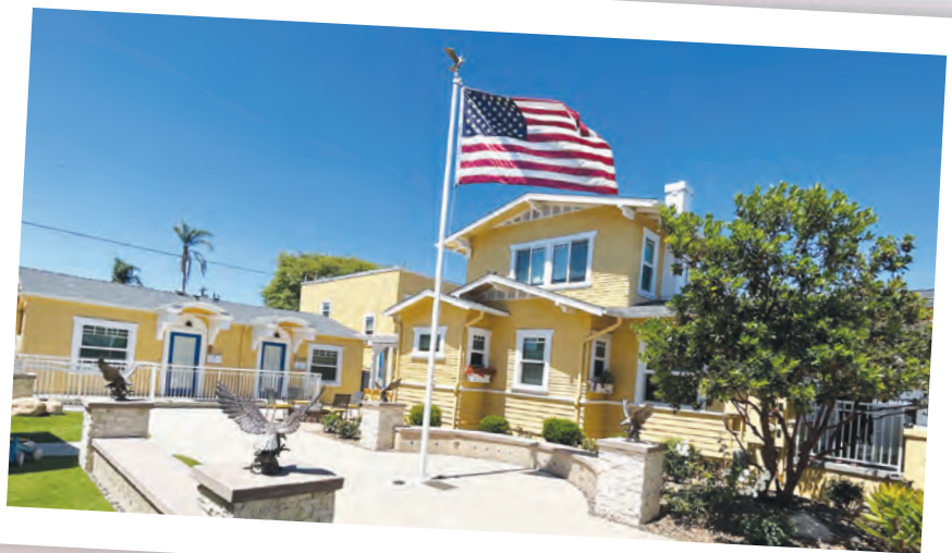
FREEDOM STATION II