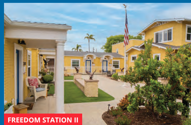
FREEDOM STATION II