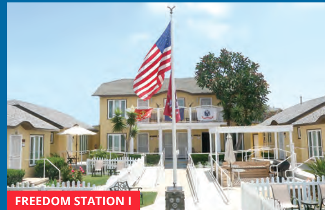
FREEDOM STATION I