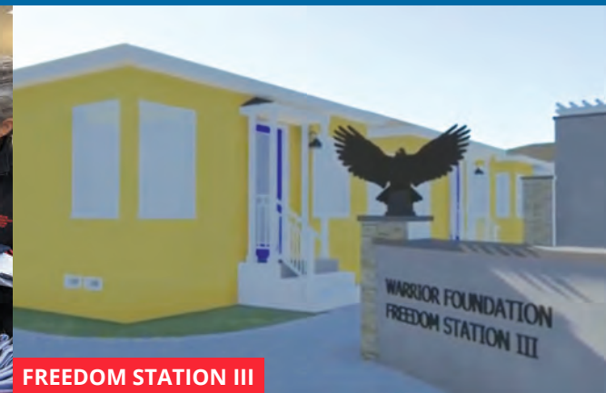
FREEDOM STATION III

The appearance of U.S. Department of Defense (DoD) visual information does not imply or constitute DoD endorsement.